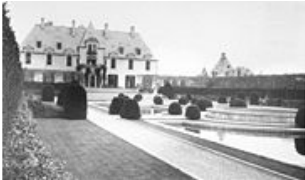
Fitzgerald's "model" house on Long Island.